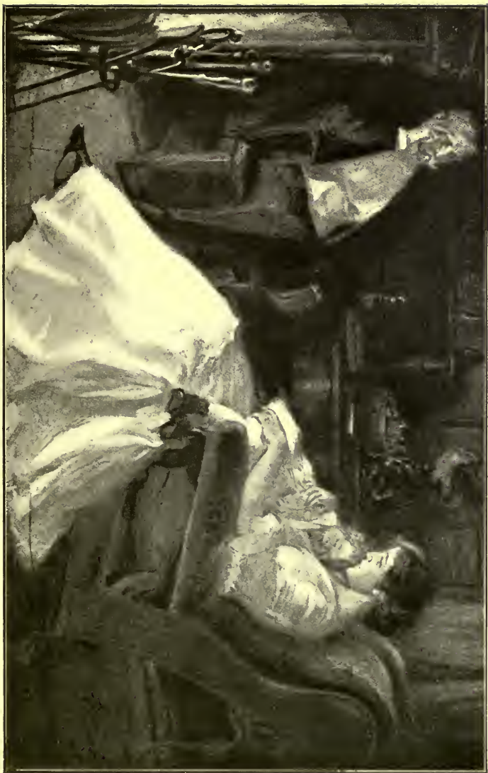
"SHE USED TO TALK OF HER HUSBAND"